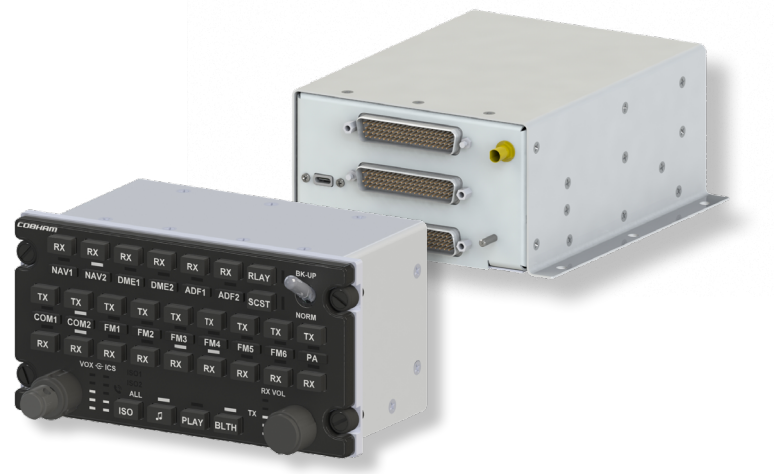
Audio Control Panels with remote-mounted Audio Management Unit.

Titan is offered in two configurations providing complete flexibility for space-constrained installations.