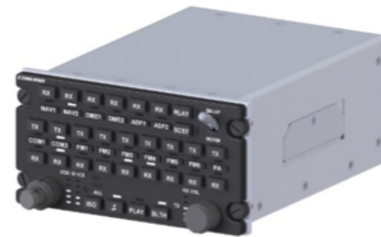
All-in-one Audio Controller.